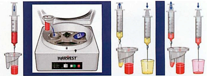
Figure 1. Isolation of PRP. Stage 1-Transferring whole blood into blood chamber. Stage 2-Load SmartPREP.® Stage 3-After processing, Platelet Poor Plasma (PPP) is isolate (Yellow). State 4-Then Platelet Rich Plasma (PRP) is isolated (red). Closed Syringe Harvest of Autologous Fat.

Figure 3 displays a female patient 1 year after autologous fat grafting with PRP to the nasolabial folds